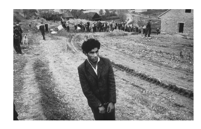
Jarabina, Czechoslovakia, 1968