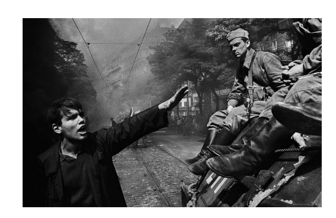
Prague, August 1968