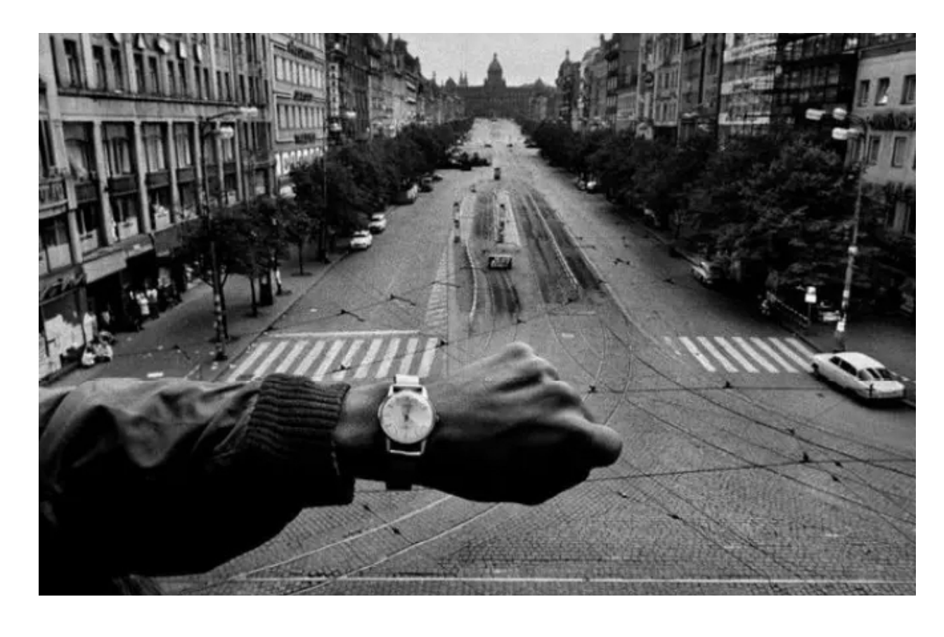
Prague, August 1968