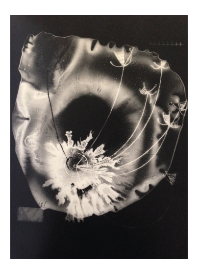
Heinz Hajek-Halke Untitled, ca.1965

Augusta Edwards Fine Art 4 Cromwell Place London SW7 2JN augusta@augustaedwardsfineart