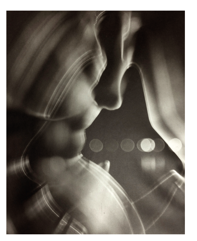
Heinz Hajek-Halke Female Impression, ca.1947-50