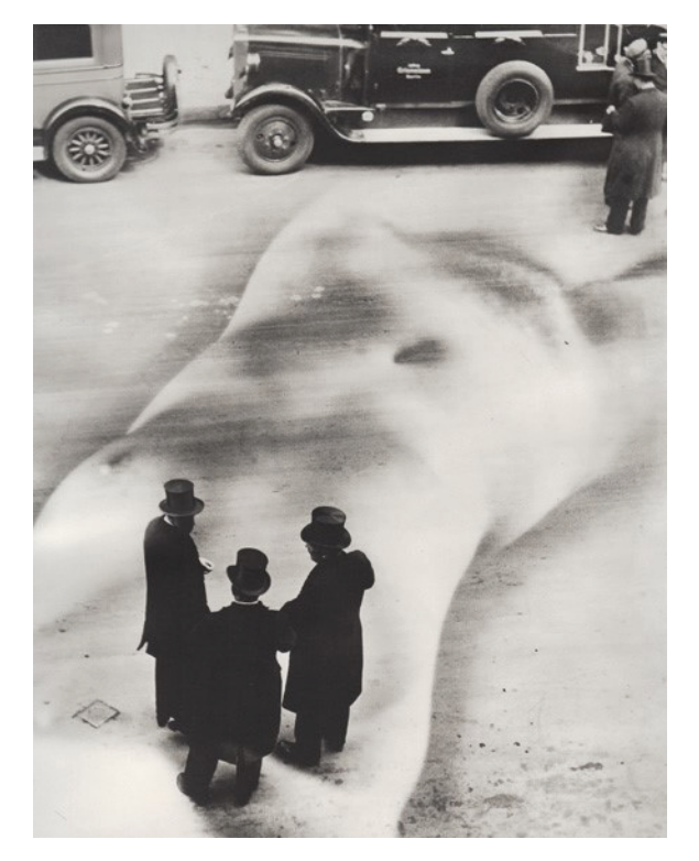
Heinz Hajek-Halke The Slander, 1953