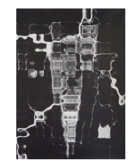
Heinz Hajek-Halke Untitled, 1950s