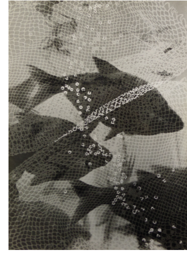
Heinz Hajek-Halke End of Dream Fish, ca. 1941